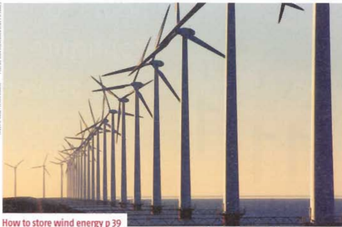
How to store wind energy p 39

COVER IMAGE: CHRIS BIRCH; PHOTO: LAMBERTUS/STILLPHOTOS