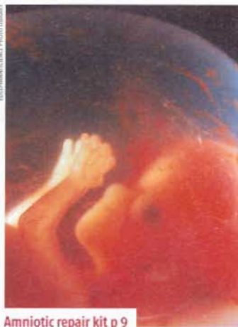
Amniotic repair kit p 9